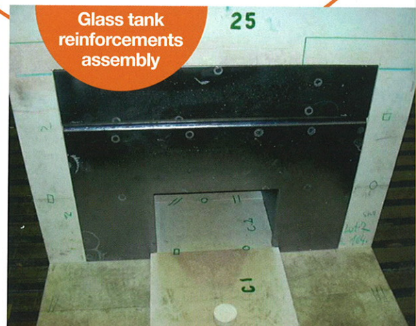
Glass tank reinforcements assembly