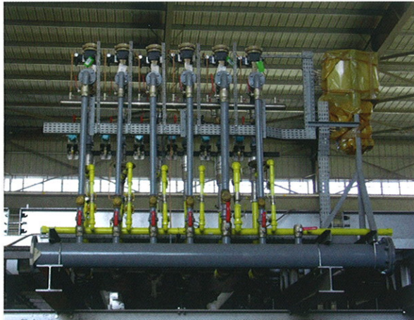
Process piping networks