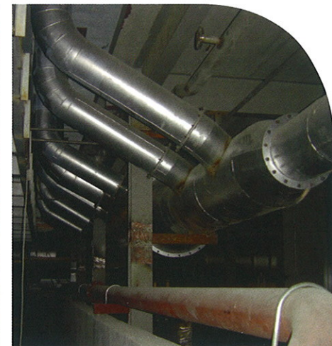
Furnace cooling network